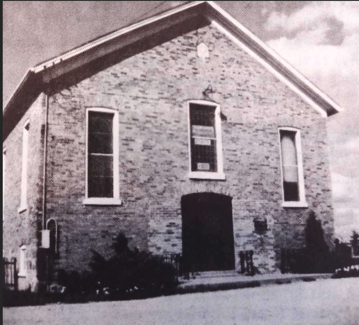
* From, Sauder, Dorothy. Trail's End, the Oxbow: History of the Bloomington Church , 1972.

One written history of Bloomington* notes that "the Schneiders were the only occupants in the Bloomington area" from 1806-1826, and yet it is also clear that the Schneiders interacted with and traded "sour milk and bread for meat" with local Indigenous peoples.